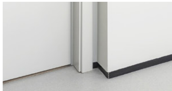
Jambs / Prumos Galces / Cadres