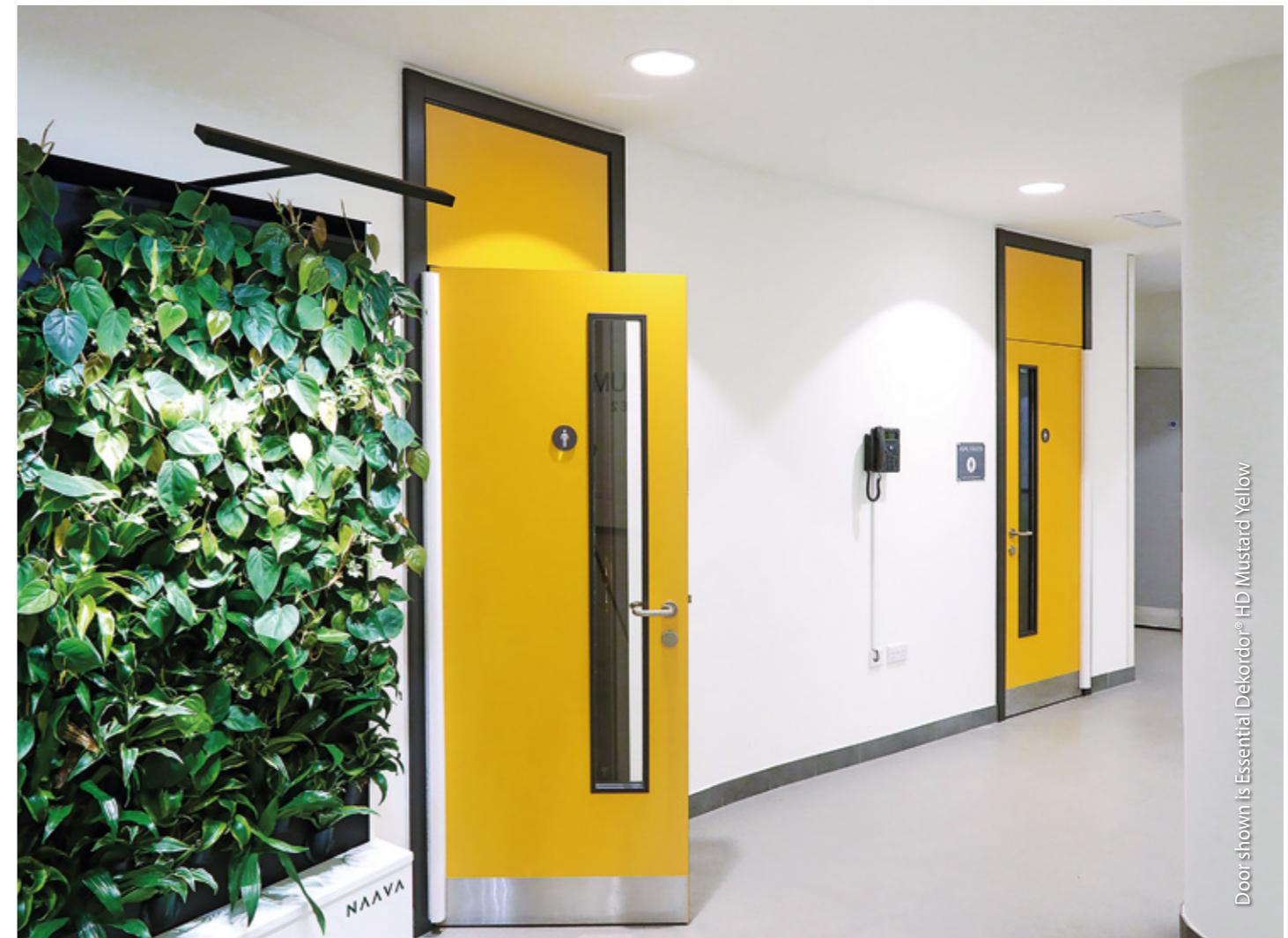
Door shown is Essential Dekordor® HD Mustard Yellow