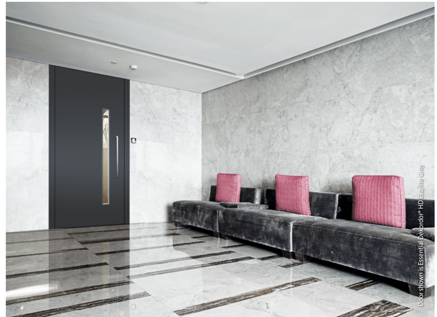
Door shown is Essential Dekordor® HD Granite Grey

Porte, cadre et panneaux avec le même revêtement Portes à grandes dimensions qui facilitent la mobilité entre les espaces Solutions Block et Portaro®, coulissantes, inverse, pivotantes et avec imposte Ouvertures pour verre et protections contre impacts Performances coupe-feu, acoustique et sécurité