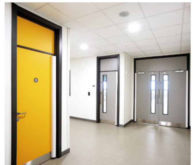
Bishop Fitzgerald Upper Primary School

EN PLEASE NOTE: Dekodor® HD Colours is subject to minimum quantities, except for white and shadow grey. Due to colour variations in printing, the images and colours presented are shown as a guide only. For more information, please contact Vicaima.