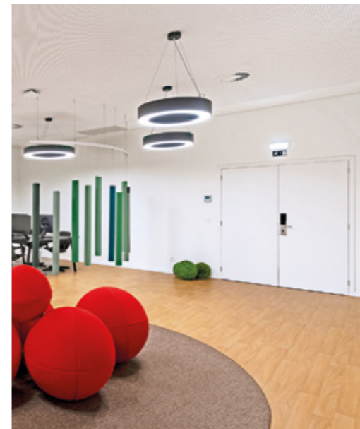
U.Hub Campus Asprela Student Accommodation