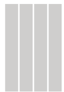
Panels / Painéis Panneles / Panneaux