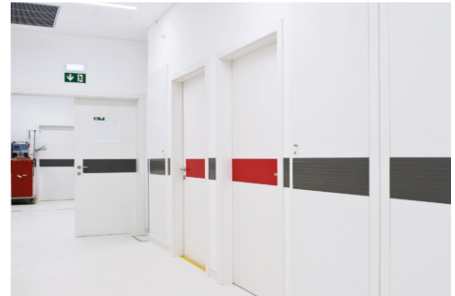
Dr. Nélio Mendonça Hospital