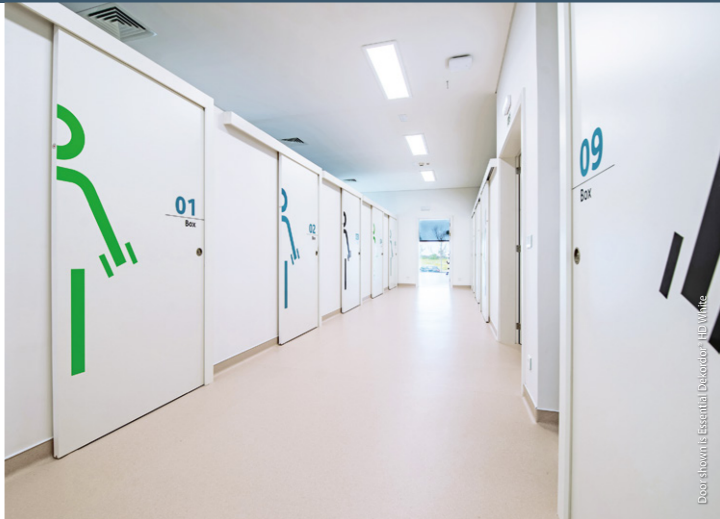
Door shown is Essential Dekordor® HD White