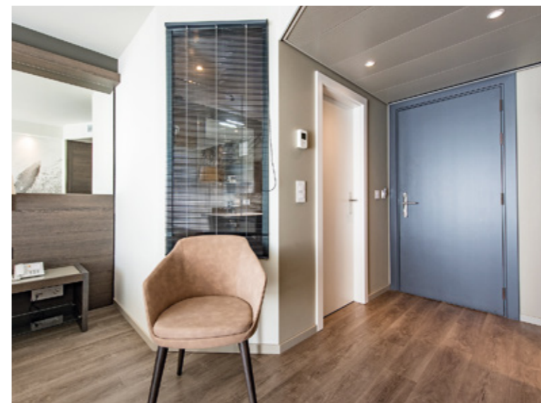
Ambassador Boutique Hotel