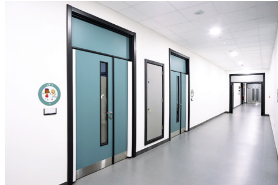
Governor's Meadow Lower Primary School