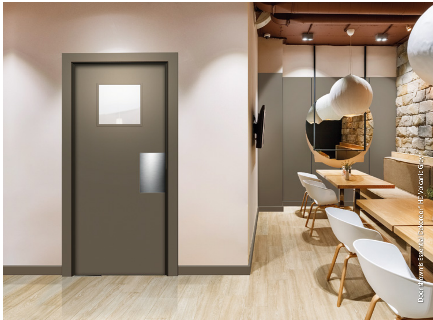
Door shown is Essential Dekodor® HD Volcanic Grey