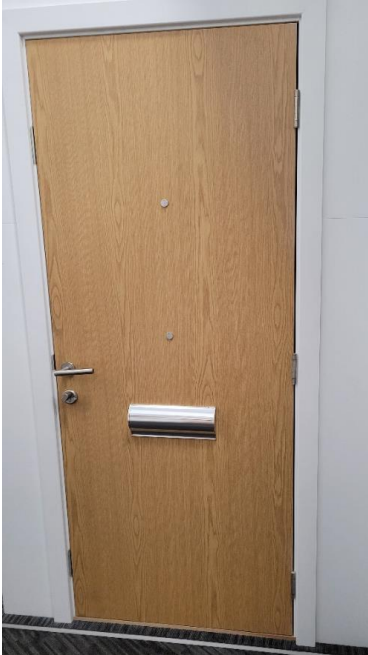
Easi-Fit SBD Autolock Letter plate optional