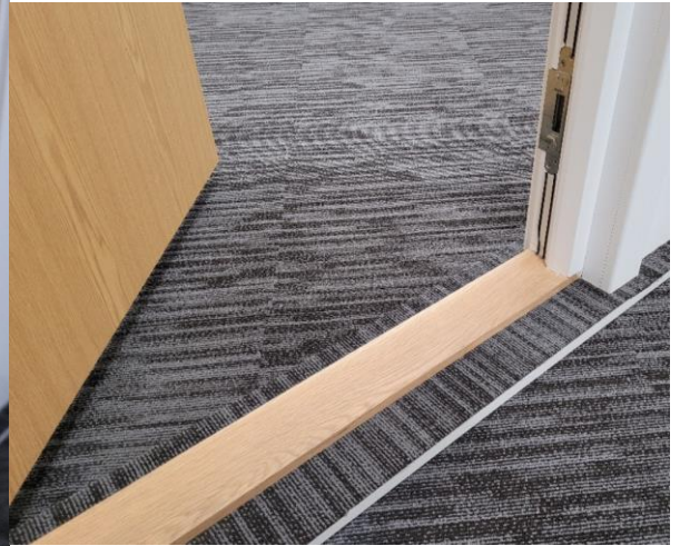
Oak hardwood threshold supplied as standard