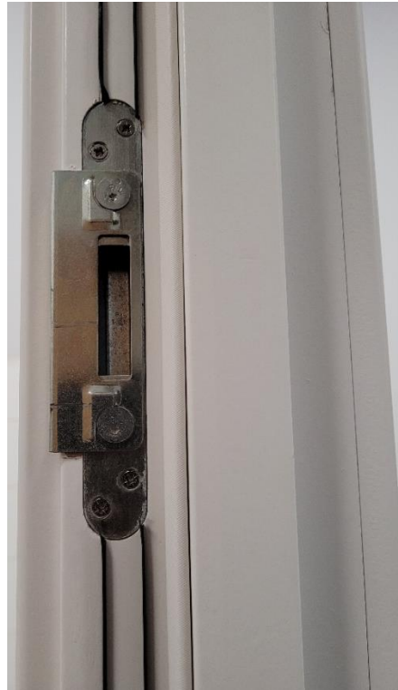
Fire, smoke and acoustic seals

Notes: As we are constantly improving our product range, we reserve the right to make changes without prior notice.