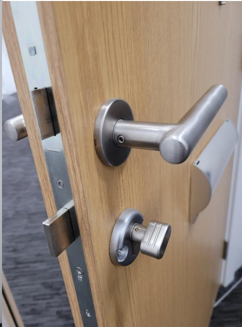
Tested and approved 3 point locking system