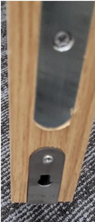
Automatic Drop Seal