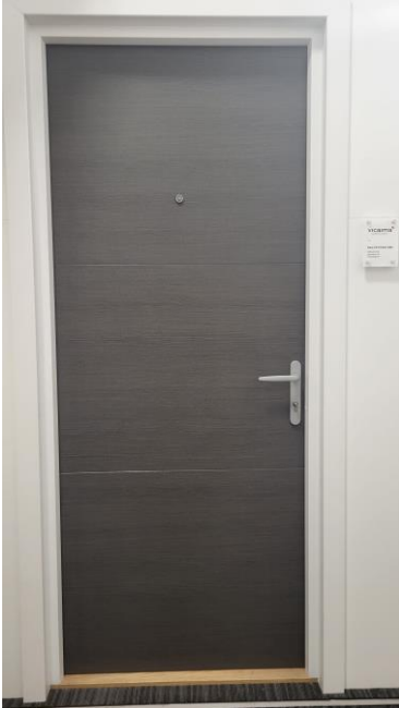
Easi-Fit SBD Liftlock