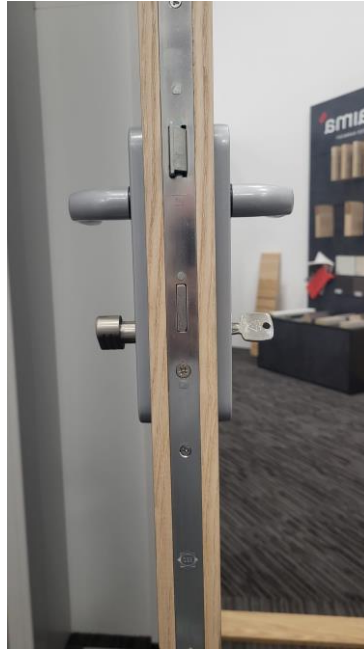
Tested and approved 3 point locking system