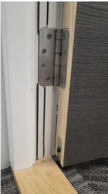
Automatic Drop Seal