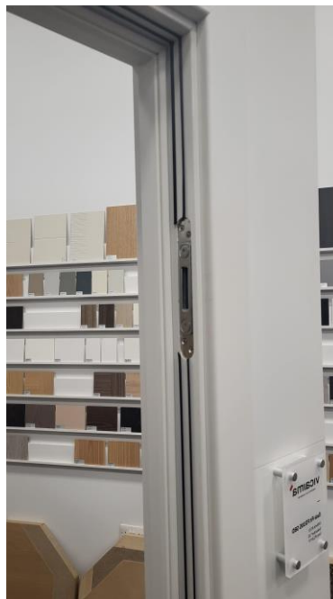
Fire, smoke and acoustic seals

Notes: As we are constantly improving our product range, we reserve the right to make changes without prior notice.