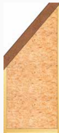
Solid Core 44mm FD30