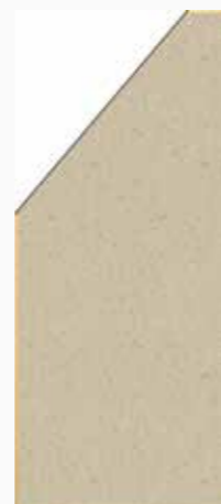
Solid Core 54mm FD60